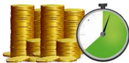
Your time-cost investment

Take advantage of our ready-to-use components that have been specifically built for WP 7 in bringing the dream Application to life.